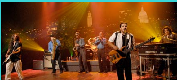
Los Lonely Boys on stage @ ACL