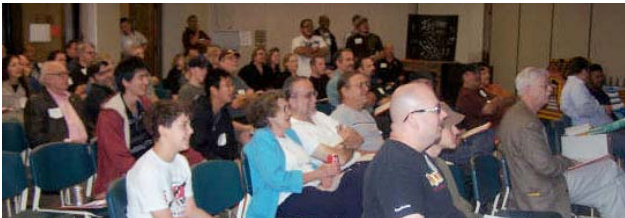
Live Auction Audience

With a large number of items, almost 1,500, the Austin Magic Auction drew 36 sellers and 135 in attendance for the annual assembly auction. This was our 28th year and the 8th year of a come-back mode that now has a permanent home at the First Baptist Church in downtown Austin. Initial reports indicate that the assembly brought in over $4,000 in profit and will be writing a check for just over $400 to the First Baptist Church.