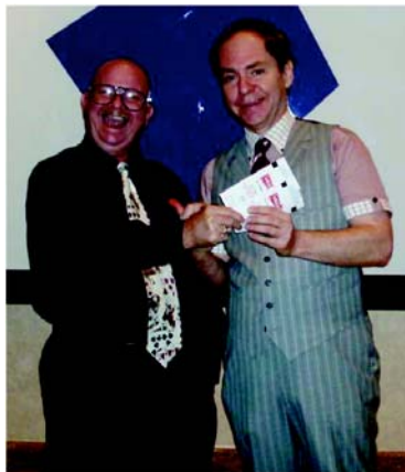
Bandini giving the secret of the bullet catch to Teller.

typical question from the audience, How did you do that? I answer in a very nice way, "Very well, thank you! Did you enjoy it?" and that usually ends the probe. Sure, you can go on the internet and see some prepubescent child teaching everything he just purchased at the magic shop. Is it ethical? Well, it's a kid for goodness sake! What do you expect? To do the same thing as a member of SAM would probably not be the thing to do. The whole truth is that ten people will see the exposure of magic in ten different ways. What more can I say? I think I could say lots more!